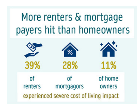
Figure 2: Percentage of households experiencing severe cost-of-living impacts by housing type<sup>12</sup>