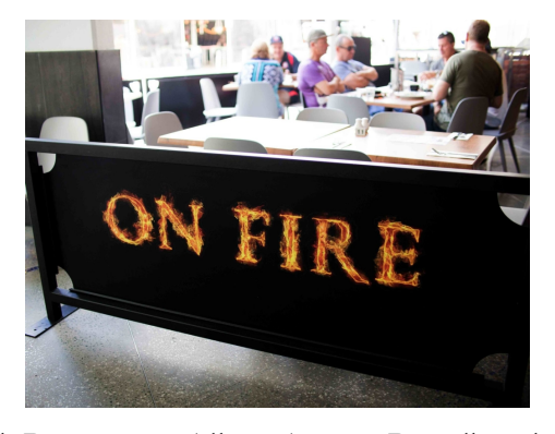
Greek Restaurant, Albert Avenue Broadbeach