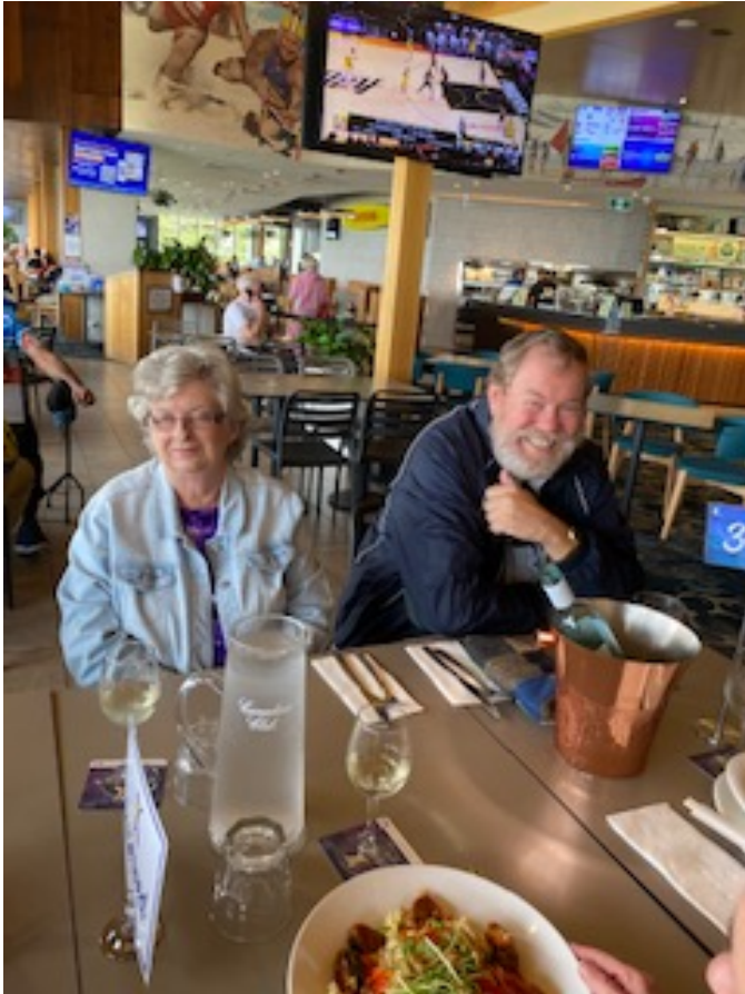
The members enjoying lunch at the Kurrawa Surf Club after the June 2nd Meeting.