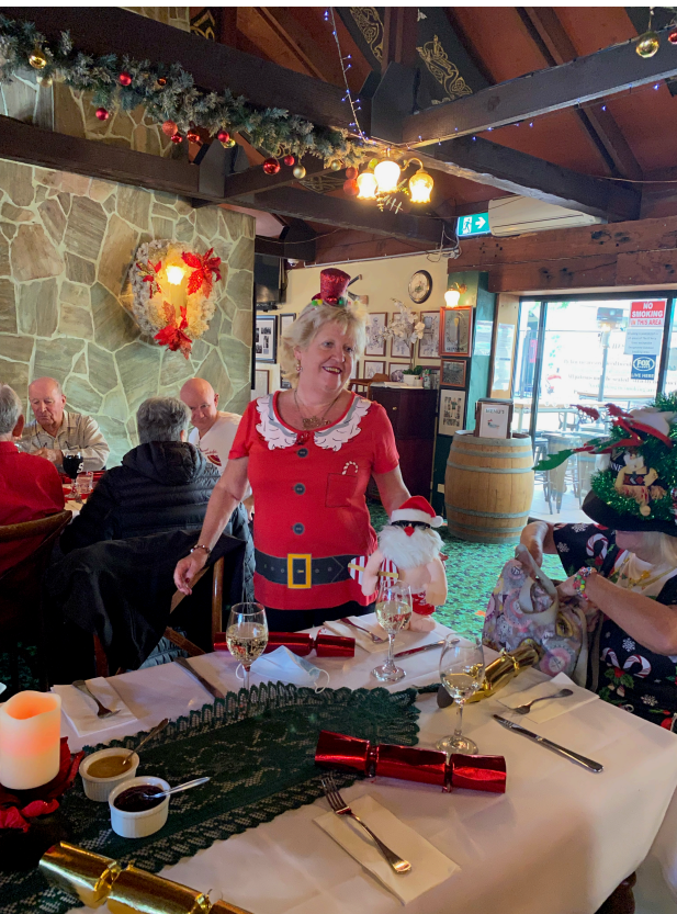
Wendy you were worth a win as well