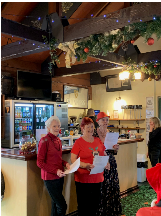
National Seniors Broadbeach ladies Choir where in good form, as usual. Go Ladies