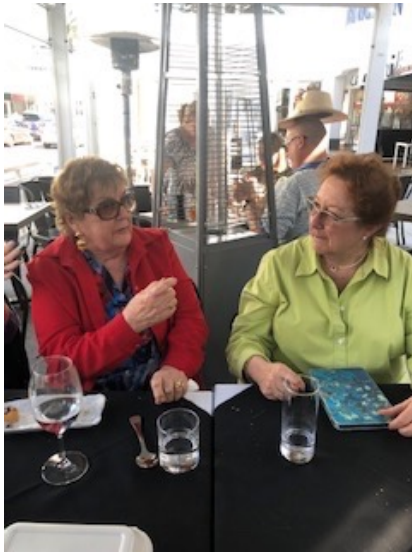
Love to know what these two are talking about?????