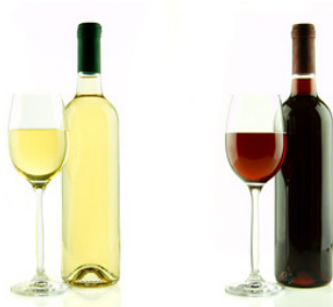
Harrington Glen Vineyard