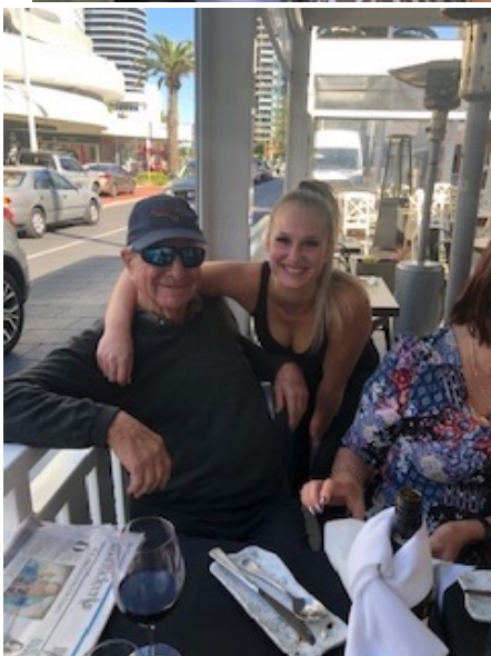
Pick the good boy??? Although everyone's wild about Harry!!