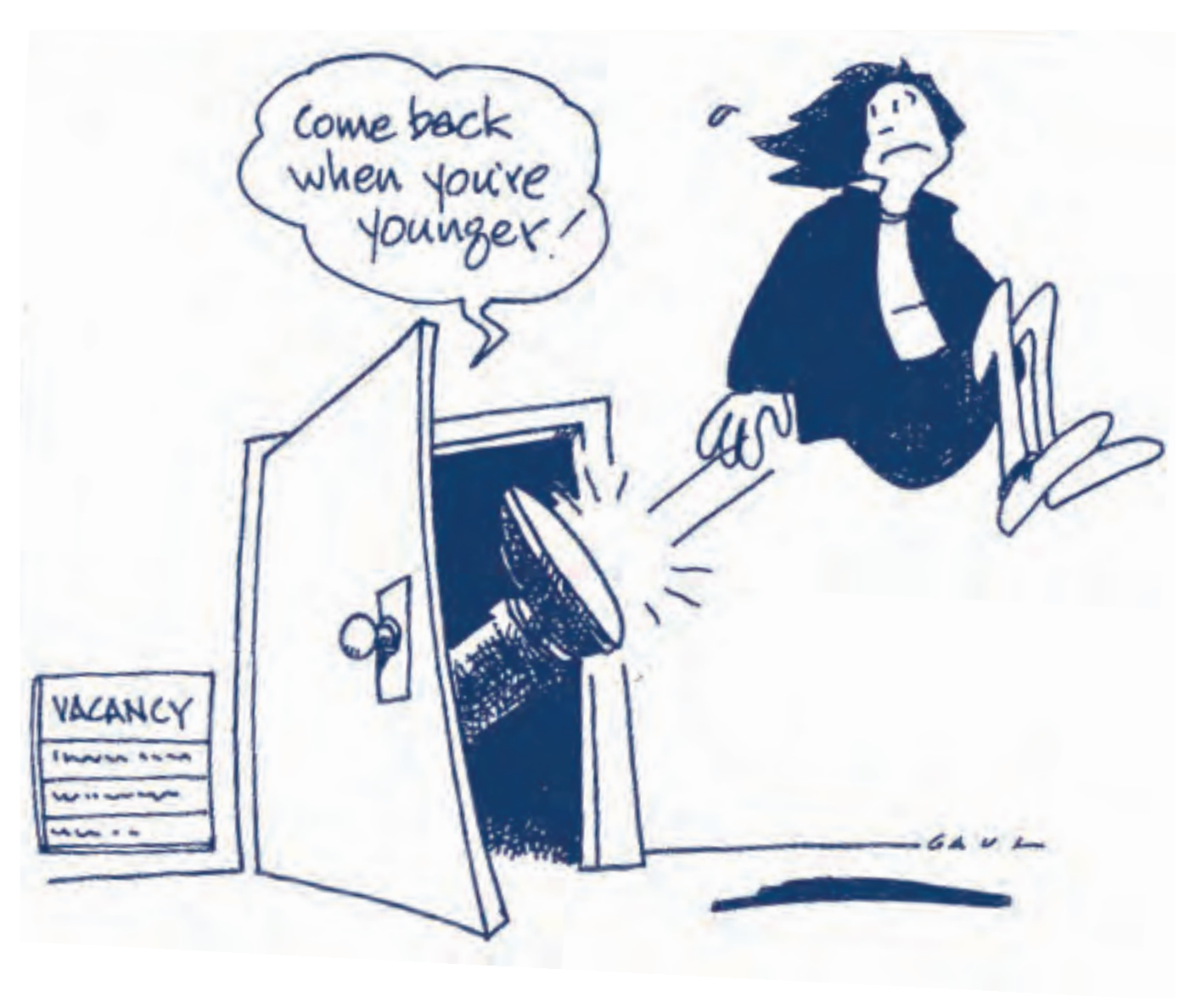
First published by Encel and Studencki (1997) and reproduced with permission.

It is to be hoped that this campaign, together with initiatives that encourage the training and retention of older workers, will ensure greater progress in the elimination of age discrimination and the promotion of fairness at work. Only then will the elephant in the room cease to be a threat.