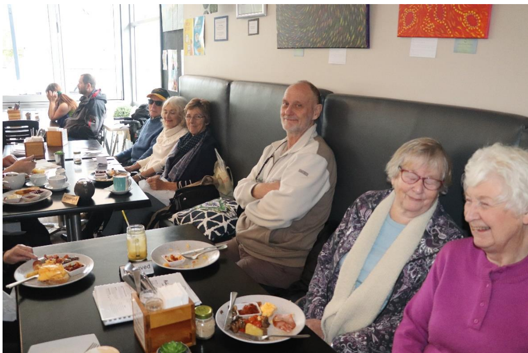
Breakfast at the Hummingbird Café, Mandurah Terrace