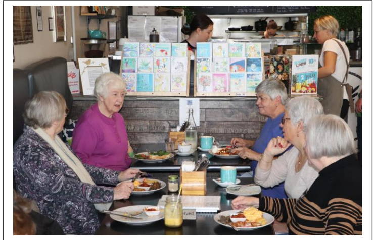
Enjoying Breakfast at the Hummingbird Café on Mandurah Terrace