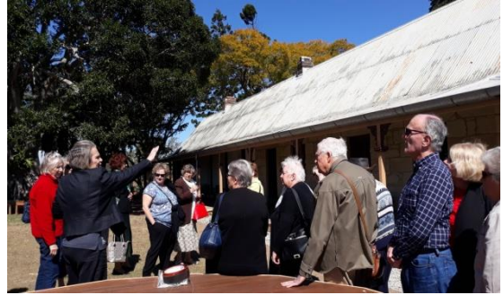
Starting the Tour