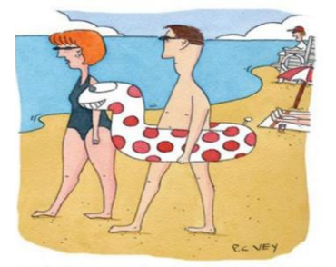
"Eventually you're going to have to get some swim trunks."