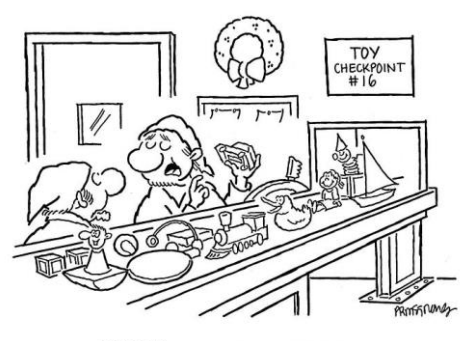
" YOUR JOB IS TO TAKE OFF THESE " MADE IN CHINA' STICKERS..."

Q: What do you call an elf wearing earmuffs?