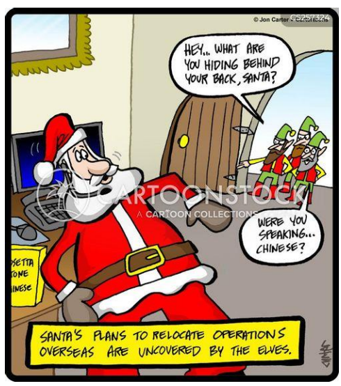
~~~~~ ***** ~~~~

Q:What do you get when you cross a snowman and a vampire?