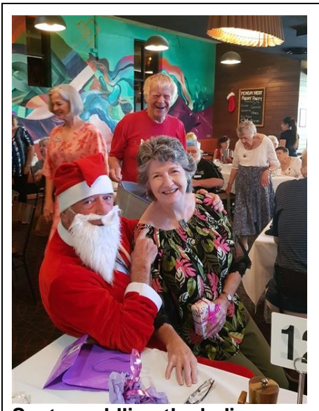
Santa cuddling the ladies...