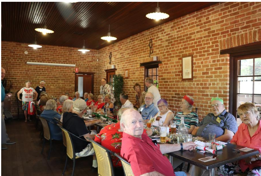
Photo taken at the Peel Region Branch Christmas Lunch.

On Monday December the 18 th many NSA MEMBERS including 6 Members from our Rockingham Branch enjoyed the End of the year Christmas Lunch which was at Redcliffe/On/Murray in Pinjarra.