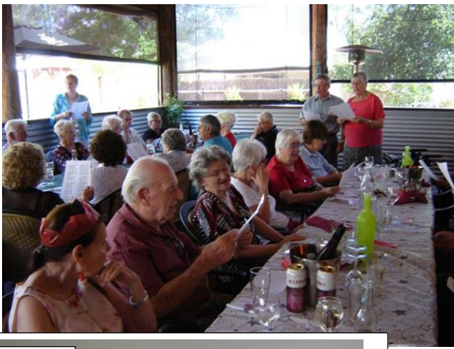
Christmas 2015 Café Coast