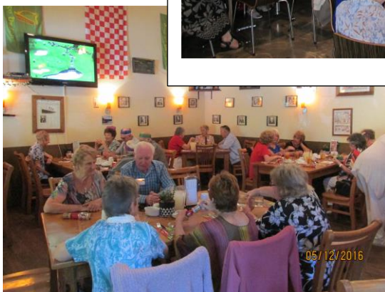
Christmas 2016 Friar Tucks Wannanup