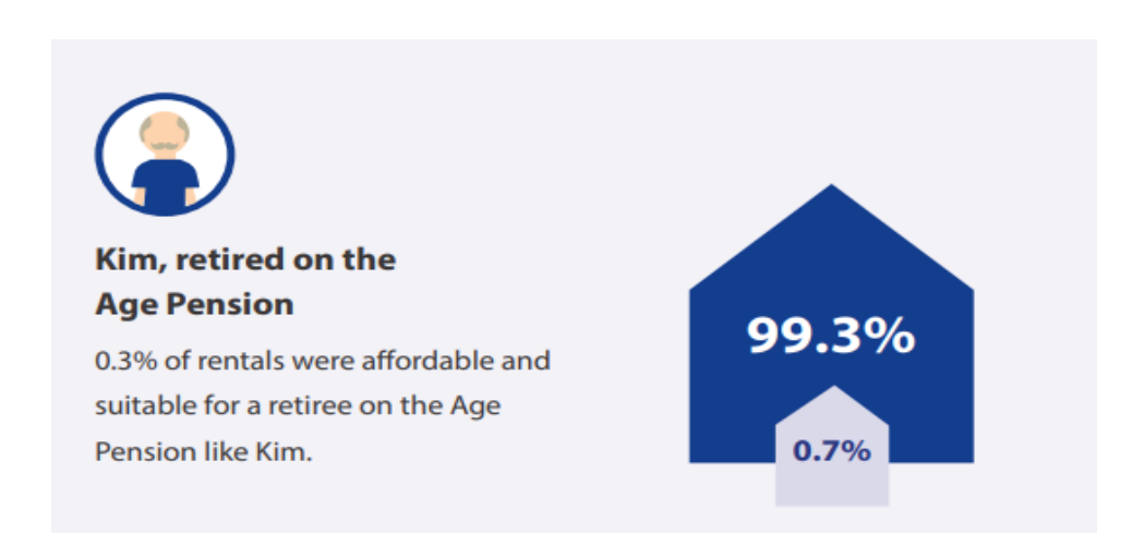
Figure 1: Affordable rental listings

unacceptable that a growing number of older Australians are forced to live in unaffordable or insecure housing (see Figure 1).<sup>3</sup>