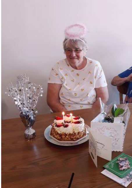
Madonna's birthday, at Café Parkinson on 14th January, six ladies attended.