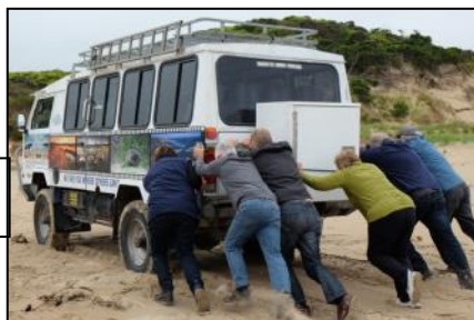
Our 'adventures' in the sand dunes