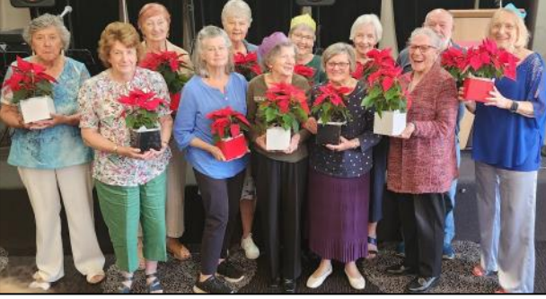
Xmas Poinsettia Winners

Bunnings have donated 12x Poinsettias for our Xmas Luncheon for many years. We have previously dealt with the Eltham store, but we are now re-zoned to the Thomastown store and the staff are just as lovely to deal with - see photo of winners!