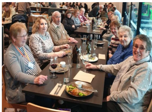
(This was a great combined invitation to members of Yarra Ranges & Maroondah NSA and the Weekend Living for Women group) National Seniors Australia & Weekend Living for Women groups enjoying a meal together