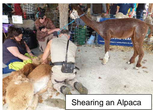
Shearing an Alpaca

Our 'Got to be in it to Win It' Raffle was popular which gave us a chance to talk to everyone about the benefits of National Seniors Australia and our very friendly Branch of Yarra Ranges who are very active with our variety of 'Out & About' activities, Guest Speakers, Walks, 'Dining Out' etc. Here are some of the attractions of the Show.