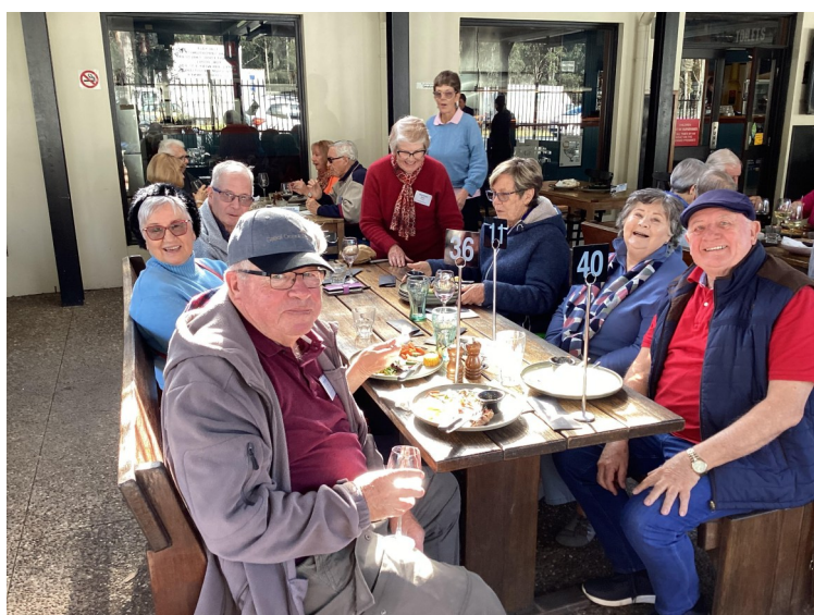
And the table with the winners of the Myster car drive ....