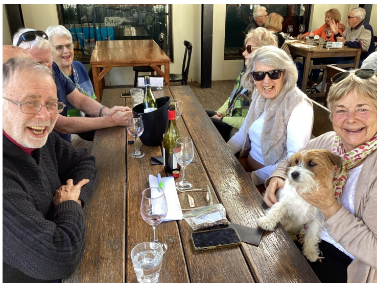
Table 1 with some of the happy Mystery Car participants