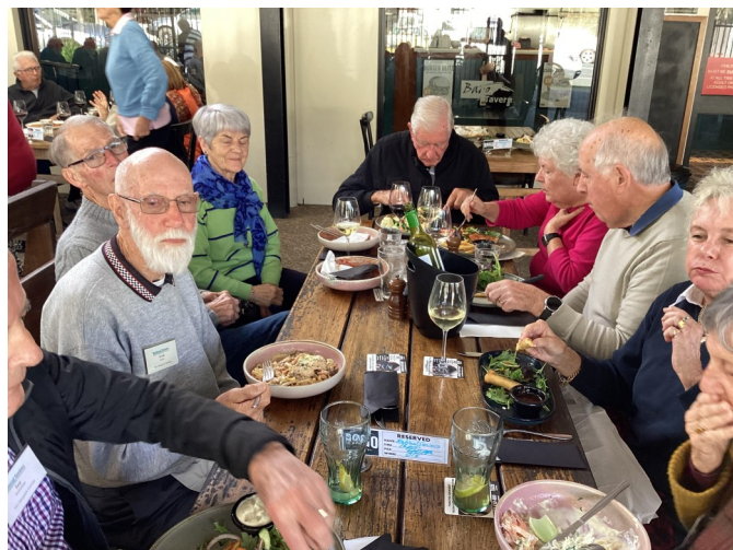
Table number 3, all enjoying each others company