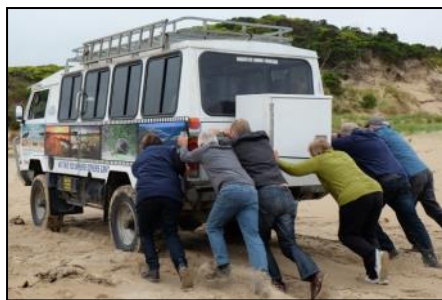
Our 'adventures' in the sand dunes