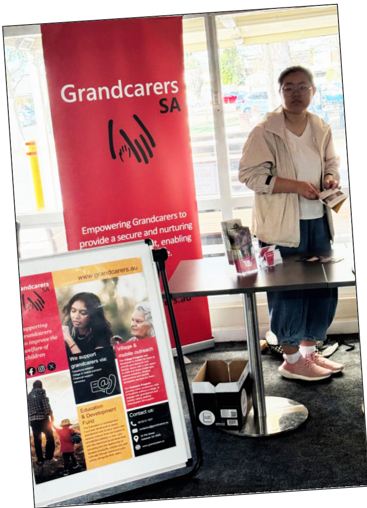
More of the many information stalls at the two Seniors Forums on Wednesday 5th March, hosted by Federal Labor MP Louise Miller Frost.