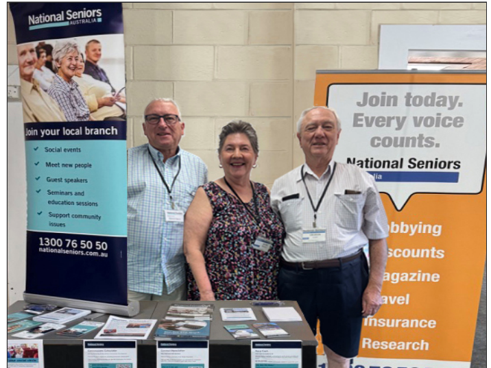
The National Seniors (Brighton Branch) information stand

A great number of people browsed the information stalls and could partake of the food provided and tea/coffee available. Overall a very successful day with much information available to South Australian seniors.