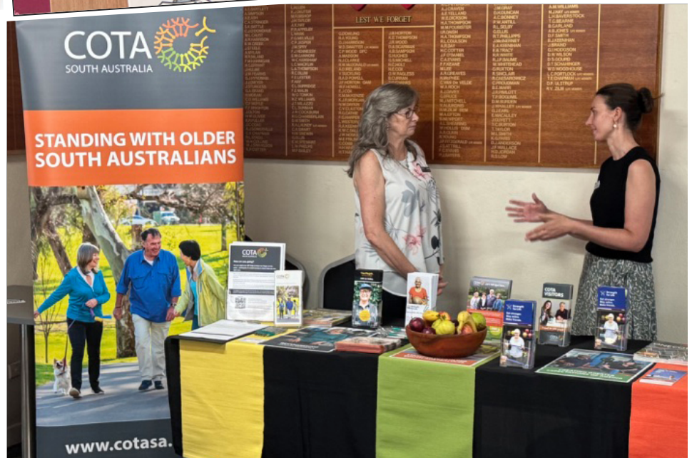
Pictured top left: The Hon Louise Miller Frost MP, Federal Member for Boothby, who hosted the Seniors Forums