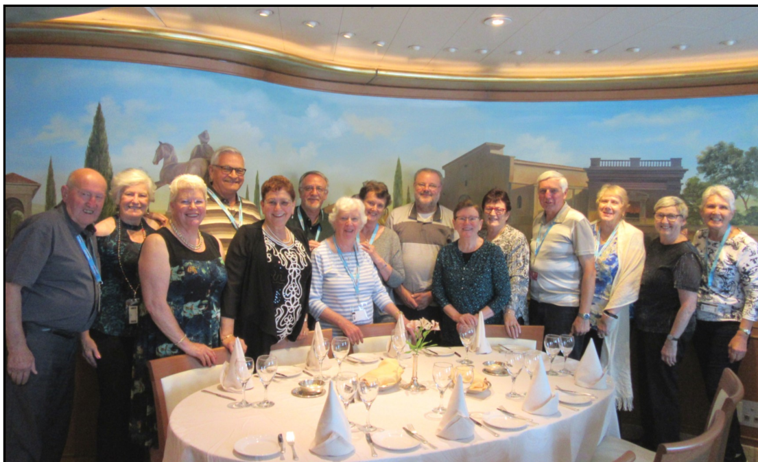
A couple of members of the Walking Group were discussing going on a cruise to New Zealand in late January - word spread and a total of 15 members & friends ended up going with them. All had a great time!