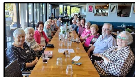
Members enjoying a Social Lunch outing to Portabella Restaurant at Albany Creek on 8/5/25