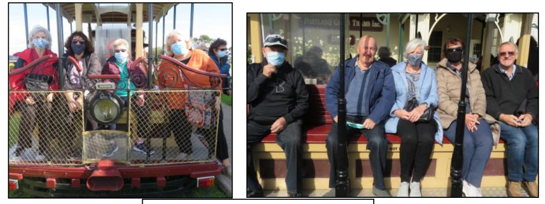
Members on the Portland Cable Tram