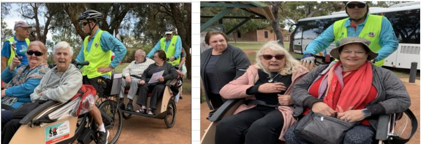
Members enjoying their Trishaw Rides at Wireless Hill

A number of our members took up the offer to try out the Trishaw rides at Wireless Hill and from feedback they enjoyed the ride and the wildflowers.