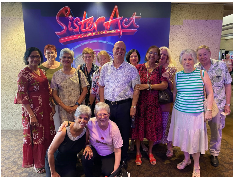
Sister Act attendees