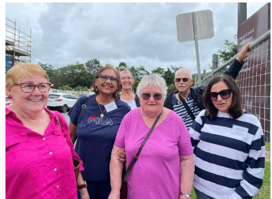
Currumbin Rock Pools with Chermside NSA