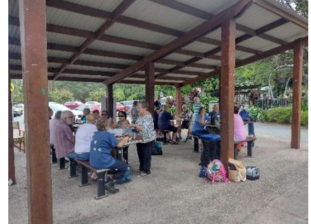
Bocce at the sausage sizzle at Pine Rivers park