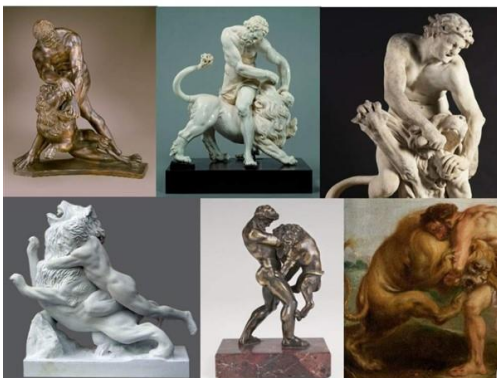
HERCULES ATTEMPTING TO GIVE HIS CAT A PILL