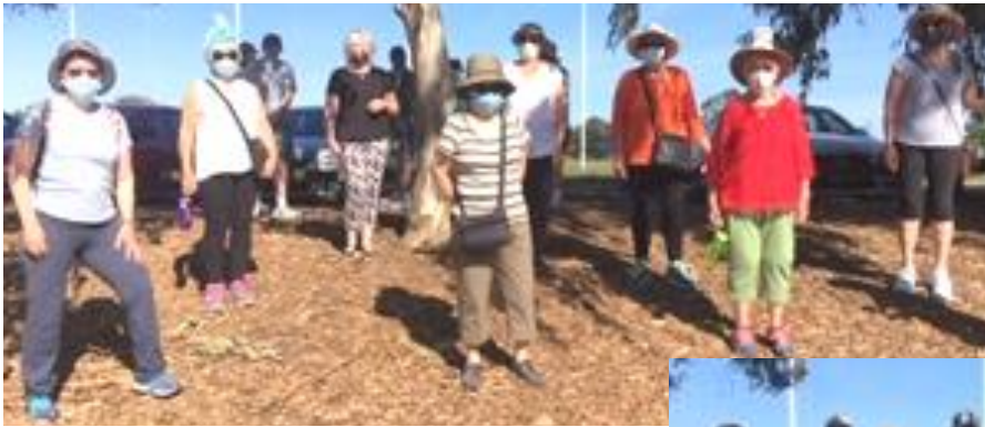
First day back for some of our Walking Club members

You will need to use a magnifying glass to see who's who!