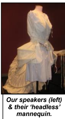
Our speakers (left) & their 'headless' mannequin.