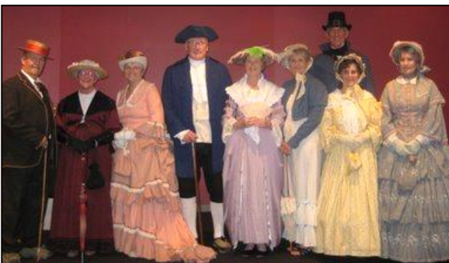
Our branch members who volunteered to dress up. I have included the other photos so that you can see their outfits more clearly.