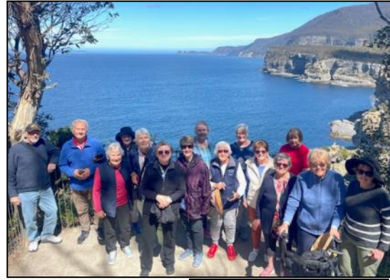
Group on Bruny Island