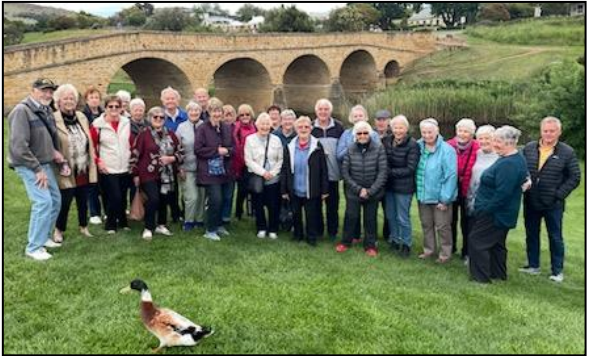
Group & 'feathered intruder' in front of bridge built by convicts