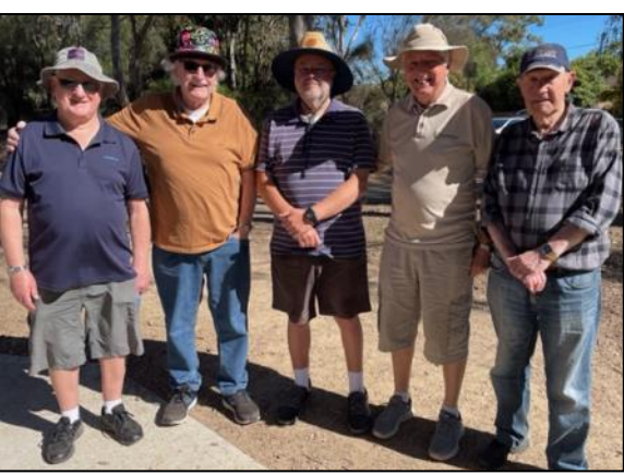
Our Walking Group wearing their hats for Cup Day