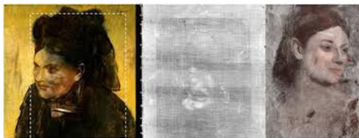
Partnership of art and science reveals a hidden masterpiece

More than 5000 researchers a year from around the world use the synchrotron instruments. The facility has been directly involved in the generation of more than 3000 publications in refereed journals.