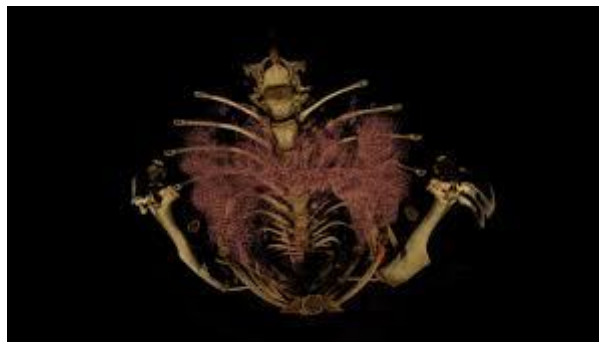
Live small animal imaging

Experiments with synchrotron light offer several advantages over conventional techniques in terms of accuracy, quality, and the level of detail that can be achieved, and are much faster than traditional methods.