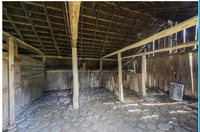
The Gulf Station stables – note the log-paved flooring