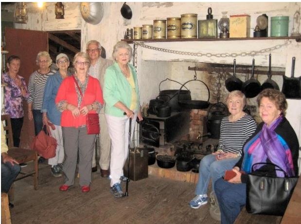
A happy (and nostalgic) group in the kitchen of Gulf Station

How can we present these artifacts, especially to the younger generations who have had no experience of them, to show what they were originally like?