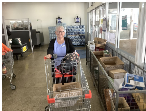
Members also managed some shopping at the shop attached to the Farmhouse as well as at the Golden Circle DFO.