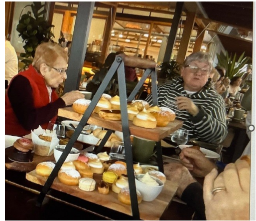
Members enjoyed the lovely High Tea at Wellington Point Farmhouse